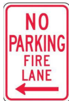
Sign Type "C"