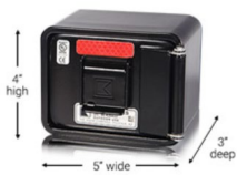
KnoxBox® 3200 Standard Capacity ⓘ

Additional keys can be placed in the Knox Box but must not inhibit the use of the Knox Box. If at any time a tenant needs to replace or update keys in his/her Knox Box, they must make the request using the electronic form on the PFA website.