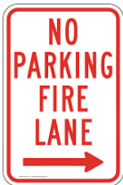
Sign Type "A"