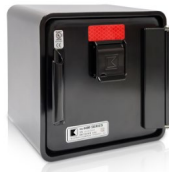
KnoxVault® 4400 Maximum Capacity ⓘ